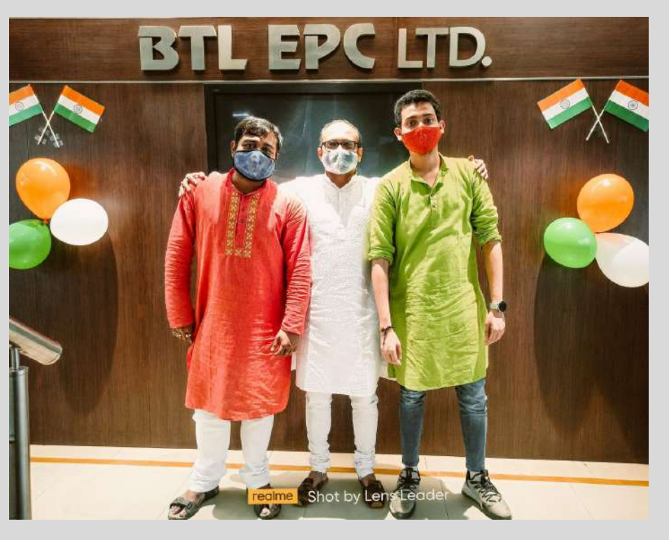
Celebration of Independence Day with Best Ethnic Wear competition in Tri-colours at the Head-Office.