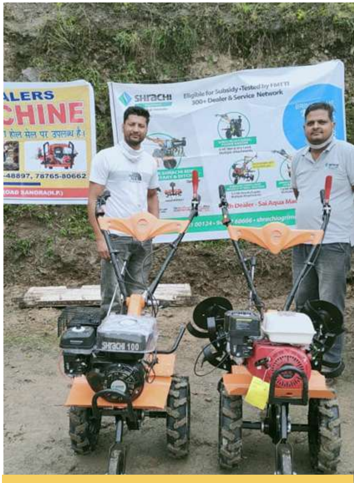
Roadshow and demo of Shrachi 100, 75Z & 8D6 power weeders in Sirmaur, HP