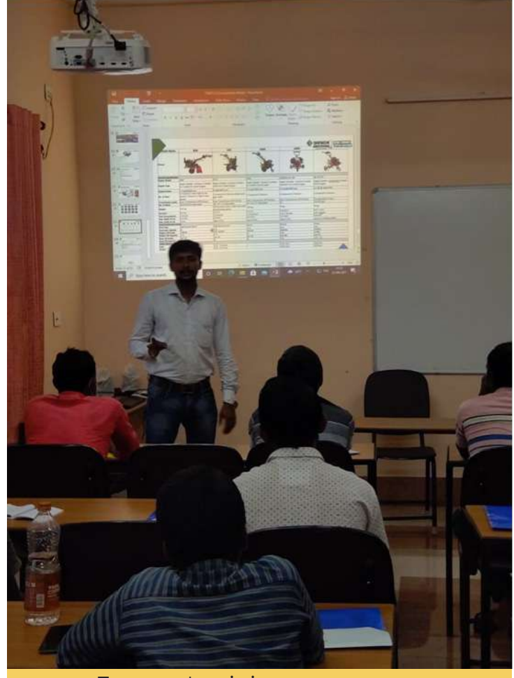
Farmers' training program at Ramakrishna Mission, Narendrapur, Kolkata